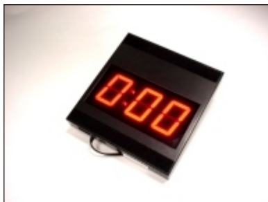
Customer Side View