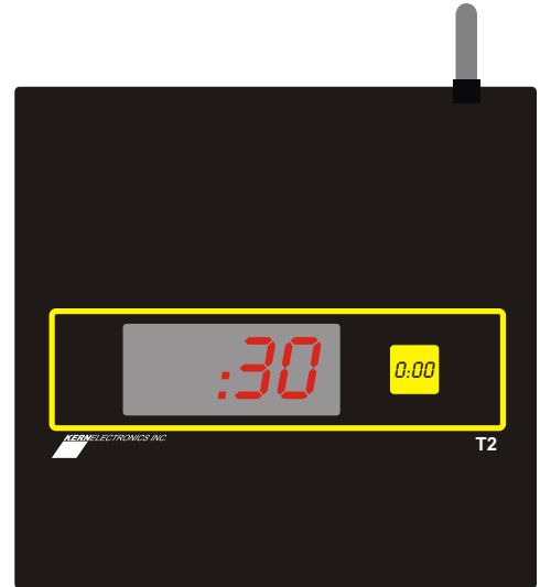
Crew Side View

The T2 Timer mounts instantly to any window or wall, and can be removed and reinstalled without damage for true portability.